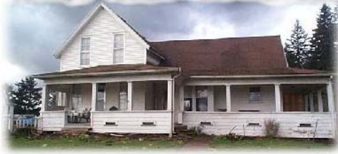
Saving the Delaney-Edwards House