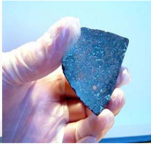
Nadiabondi H5 70.8 grams