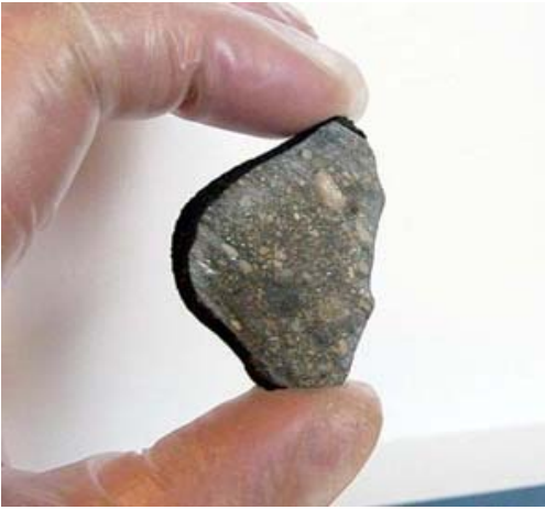
Begga LL3 11.1grams